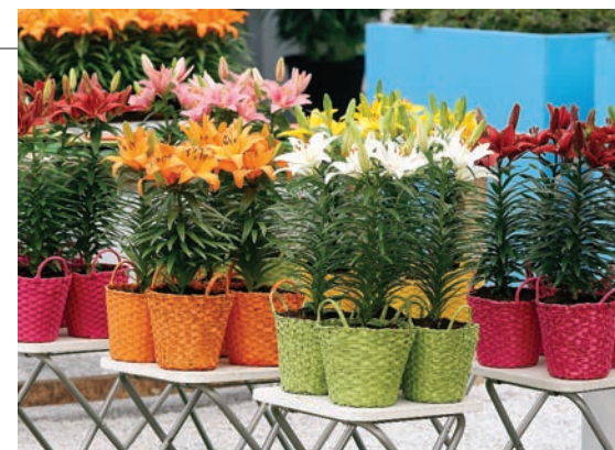
Lily Looks cultivars have flowers that open individually and create an impressive display of flower power when numerous blooms are open simultaneously.

release fertilizers into the growing medium prior to planting at a rate equivalent to 1 lb. elemental nitrogen per yard of growing medium. Controlled-release fertilizers work rather well for lily crops, as it often takes a couple of weeks for the fertilizer to start releasing. This coincides with the period of time the plants naturally derive their food from the nutrient reservoirs of the bulbs.