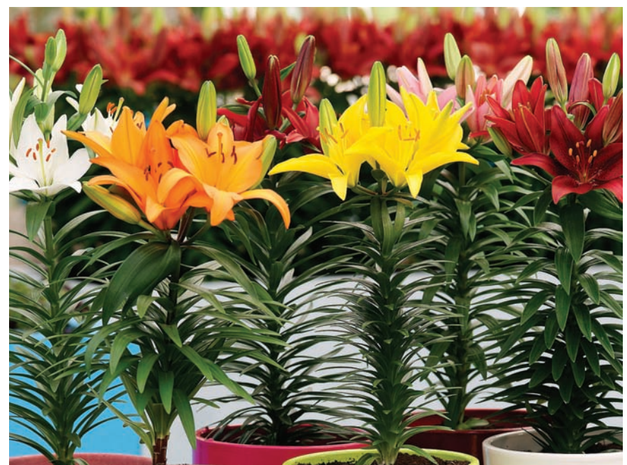
These dwarf cultivars are available in various flower colorations that are all well suited for commercial production.

** Average days to finish when produced at 60° F average 24 hour temperatures.