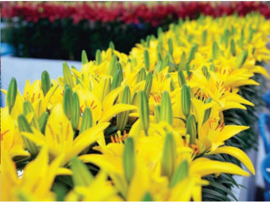
Lily Looks cultivars reach 12-20 inches when in bloom and produce large, 6- to 8-inch-diameter flowers.

Asiatic lilies are particularly sensitive to PGR applications.